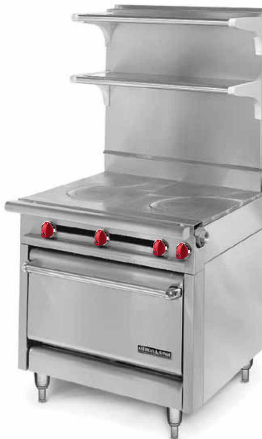
Model Shown HD34-2FT-I